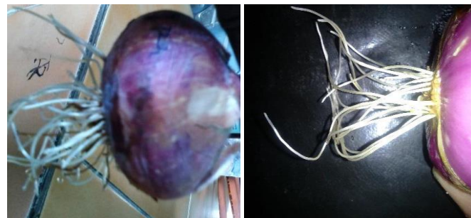
Fig. 3 (A) Non treated (B) Onium root treated by onium root ETTM (100 mg/mL) after 72 h